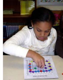
Working in the classroom with a hundreds chart.