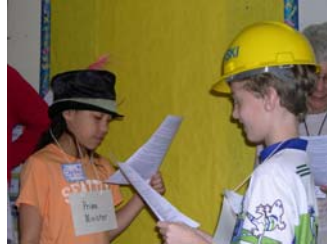
In an elementary class during the playlet for How Big is a Foot?